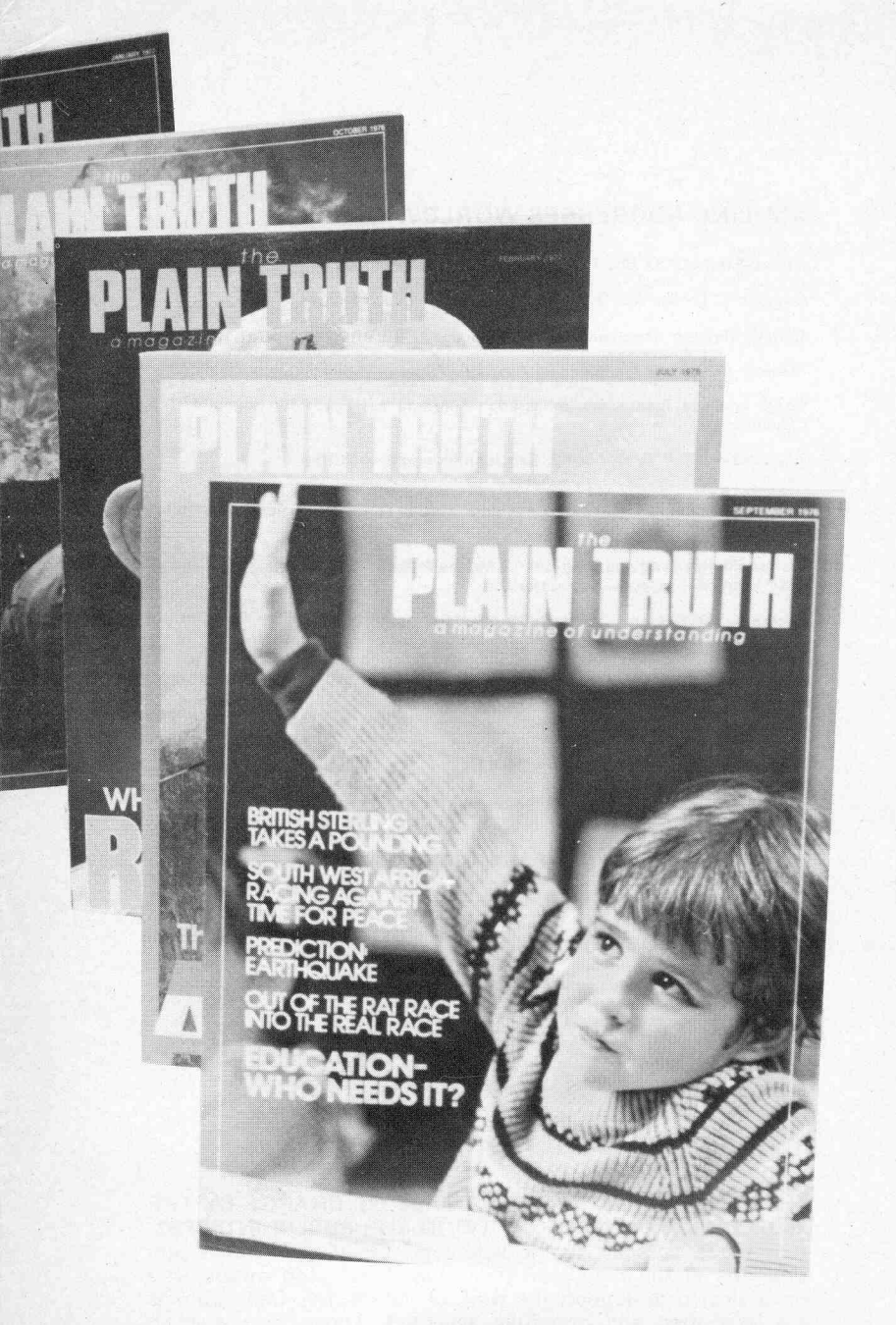
still ahead of its time!