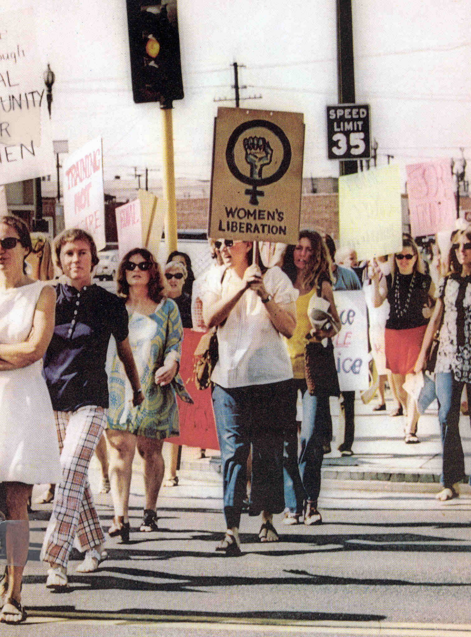
"WOMEN ON THE MARCH" — Placards show grievances of women, as they parade during "show of force."