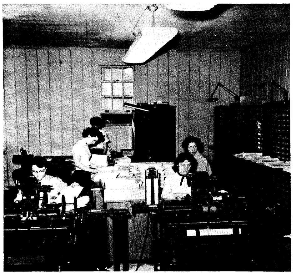
Ambassador College Press Mailing Department as it was in the years of 1948 through 1956.

keeps abreast of Church activity and progress.