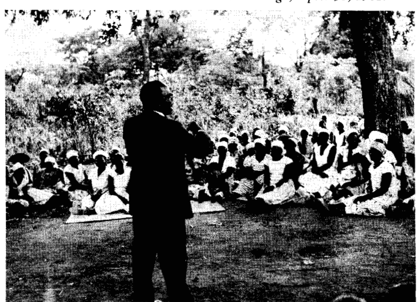
Service conducted at Kasenga's Village on May 7.