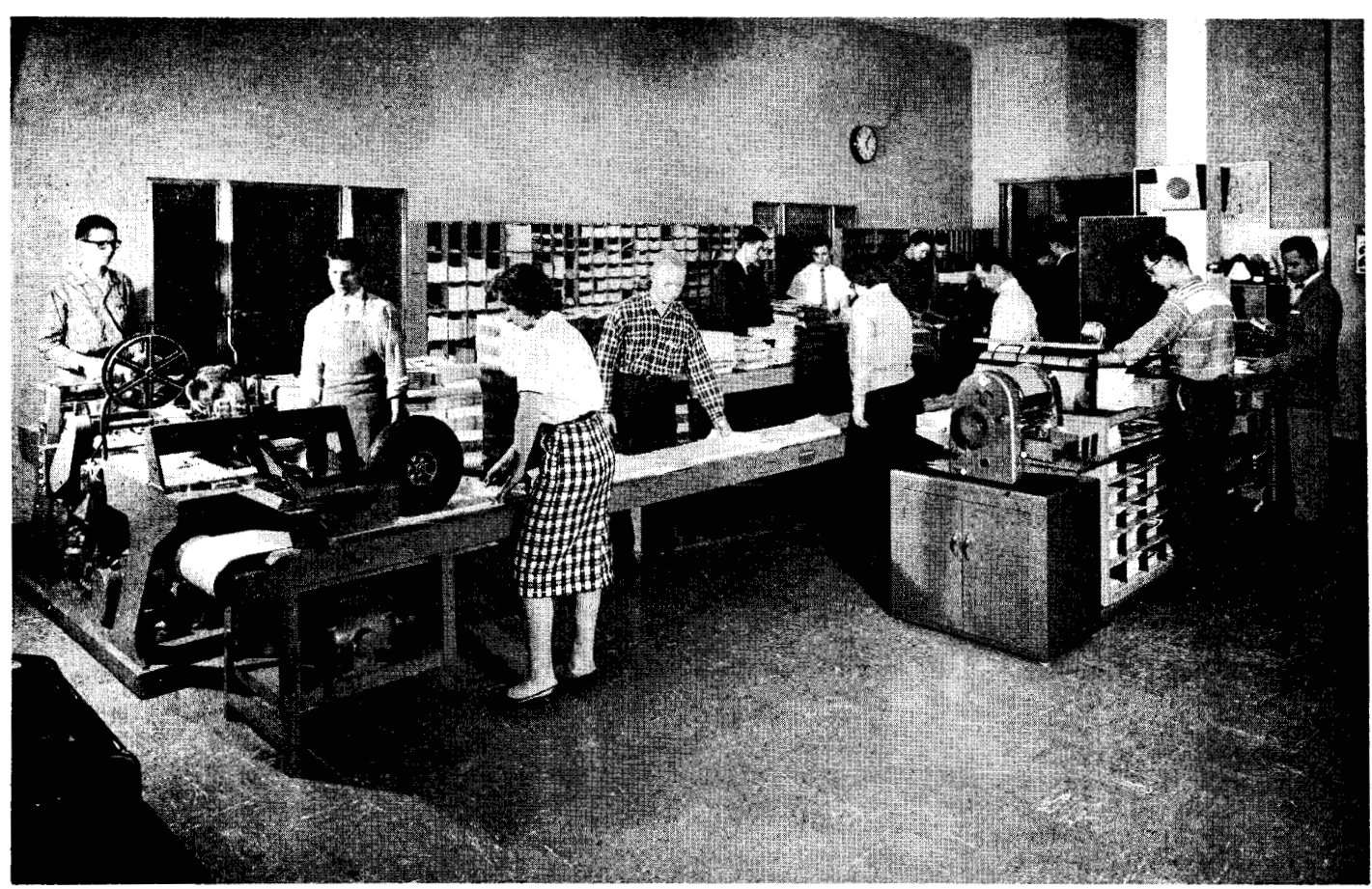
Ambassador College Press Mailing Department as it is today — 1961 — showing part of our new IBM electronic system.