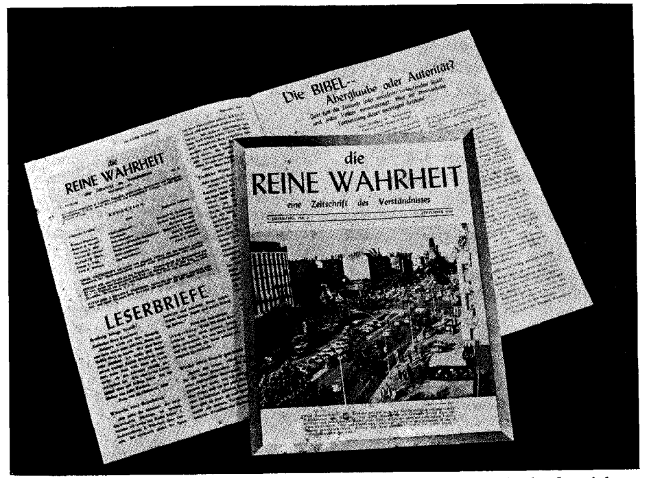
The September issue of Die REINE WAHRHIET open to the lead article.