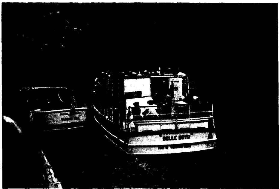
Clayton - Ambassador College