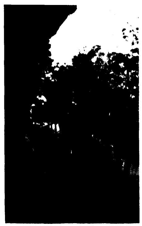
Clayton — Ambassador College As a resort area the Dells offers many forms of recreation — from fishing and hiking along the banks and caves to the famous boat rides through the scenic, natural beauty.

air miles from Chicago. The City of the Dells has a population of only 2,100. However, the area has some of the finest motel accommodations anywhere and the Dells is just about right for sixteen or seventeen thousand people. The entire area can provide for approximately 30,000 people.