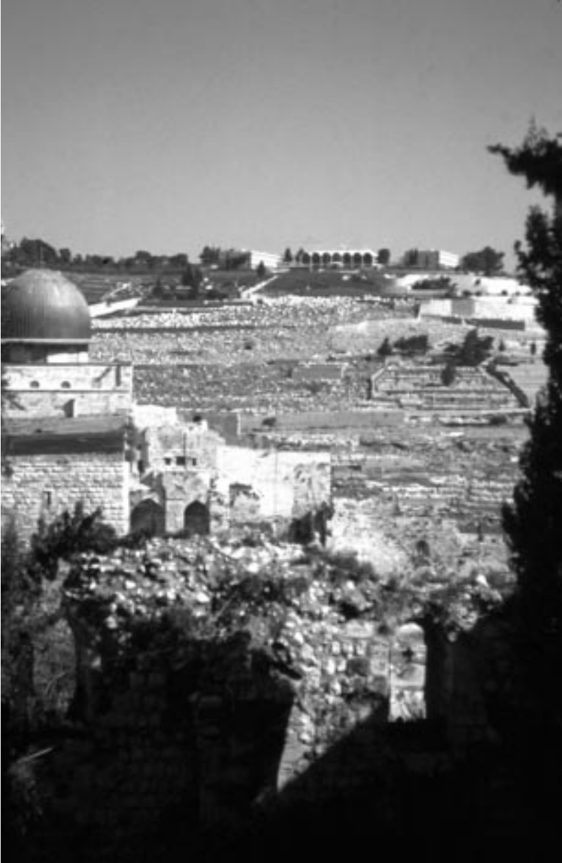
View across the Kidron Valley toward the Mount of Olives