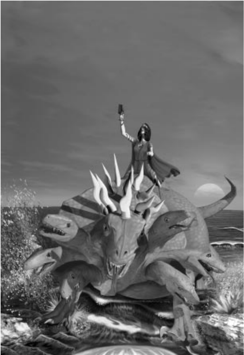
Revelation 17 describes a woman—understood to represent a false religious system—who “rides” a “beast” representing an end-time revival of the Roman Empire. ©TW Illustration—Courtesy of Bruce Long.