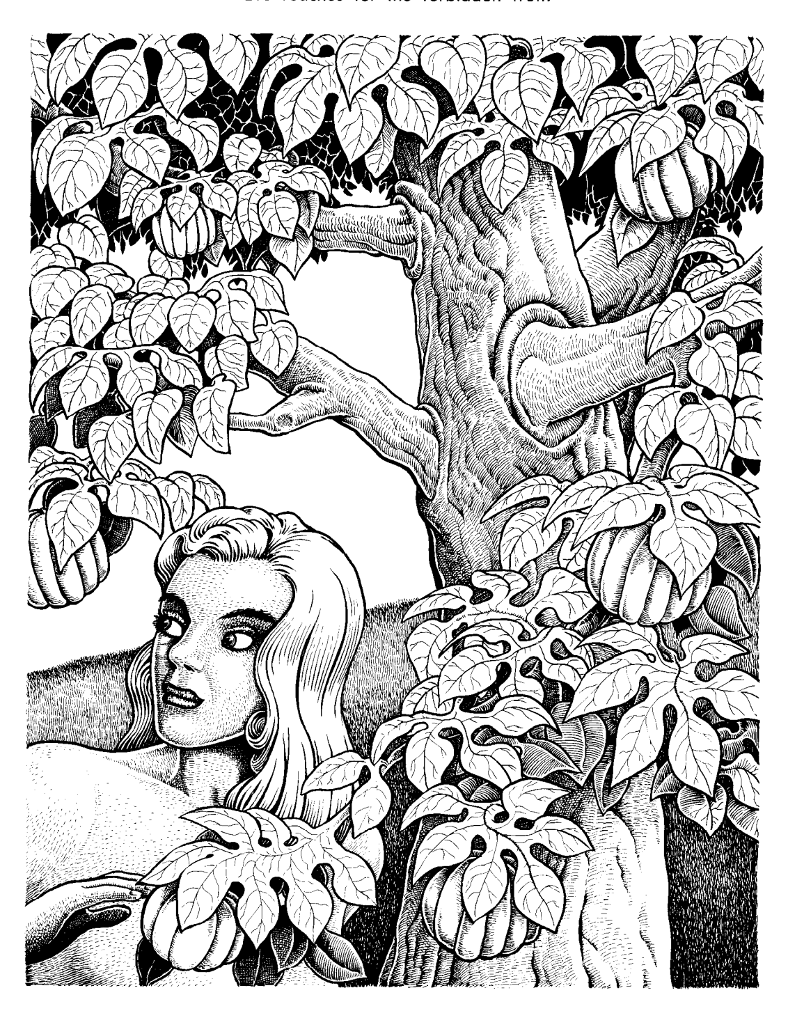
Eve reaches for the forbidden fruit.

so they sewed fig leaves together to make aprons to put around them. Because they had disobeyed God's wonderful law by eating the fruit they had