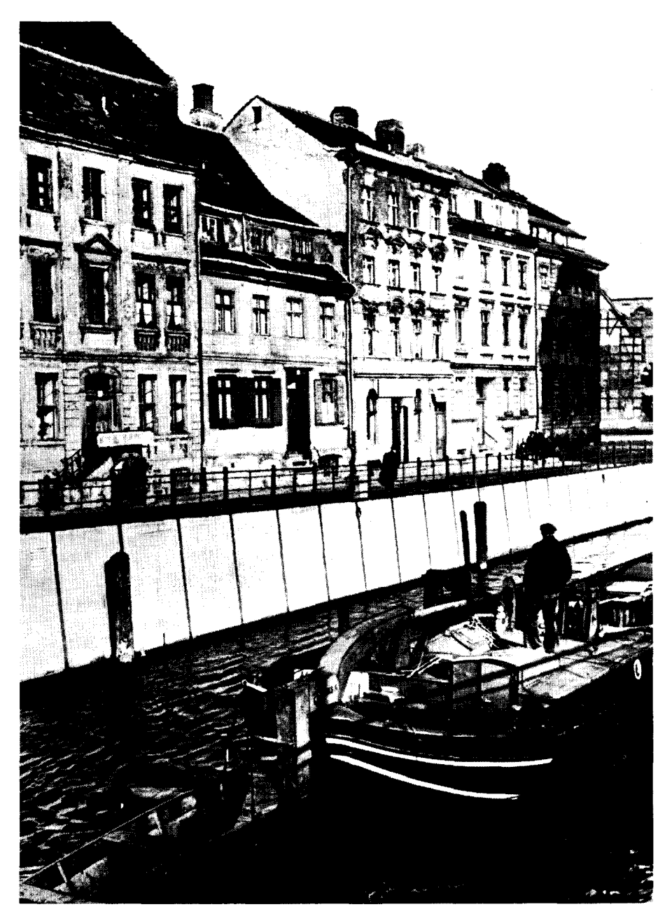
Amid political rumblings, East-Berliners remain quiet, go about their daily chores, and hope for the day when their land can once again be joined to a powerful, revitalized New Germany!