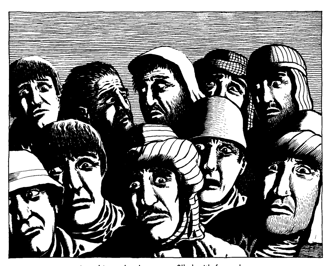
Joseph's ten brothers were filled with fear when they were told that they would be jailed.

"But we are telling the truth!" they called to Joseph as guards roughly led them away to a dungeon. (Verse 17.)