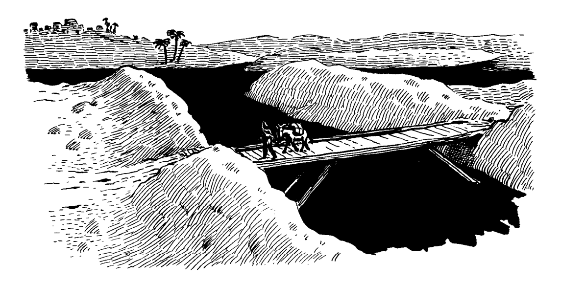
Under Joseph's direction, the Egyptians dug giant ditches to convey water to arid regions.

that land would never have amounted to very much. But during those seven years of plenty, there was much more rain than usual, so that areas far from the Nile gave most unusual crops.