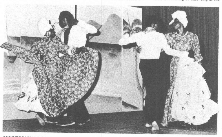
ANNIVERSARY DANCE — Tobago members dance at the ninth anniversary celebration of the Trinidad and Tobago church Aug. 9. (See "Church Activities," this page.)

Senior citizens of the BING-HAMTON, N.Y., church enjoyed a meal and evening of fellowship at the