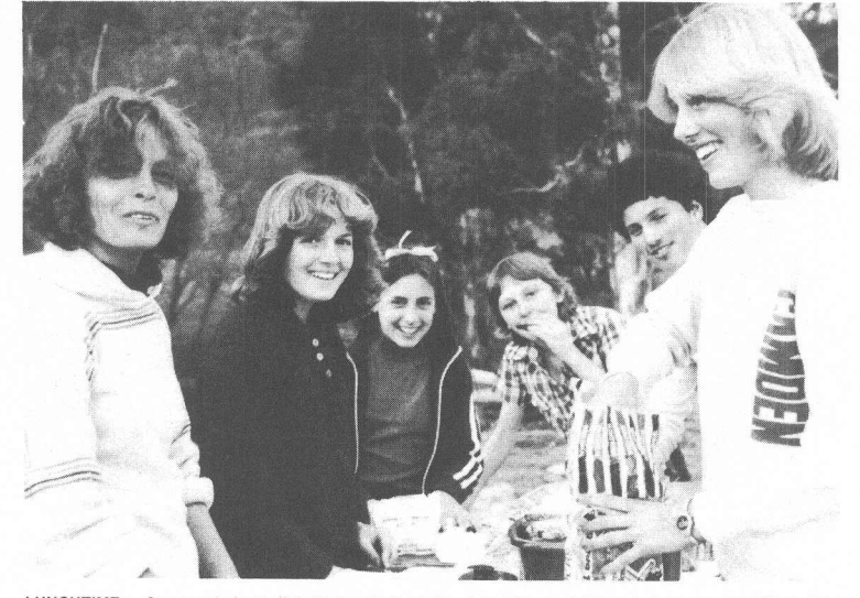
LUNCHTIME — Campers in Australia's Wolgan Valley take a break for sandwiches during a camp-out Sept. 11 to 13. (See "Youth Activities," page 6.)