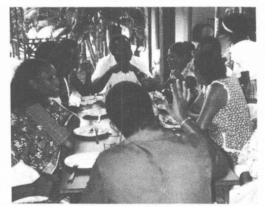
FEAST FELLOWSHIP — Brethren at God's Festival in Trinite, Martinique, enjoy animated fellowship. Nearly 300 people attended this Frenchspeaking site.

God's Holy Days. Activities included a gettogether supper, a tour of the area, family night, sports contests, Her-