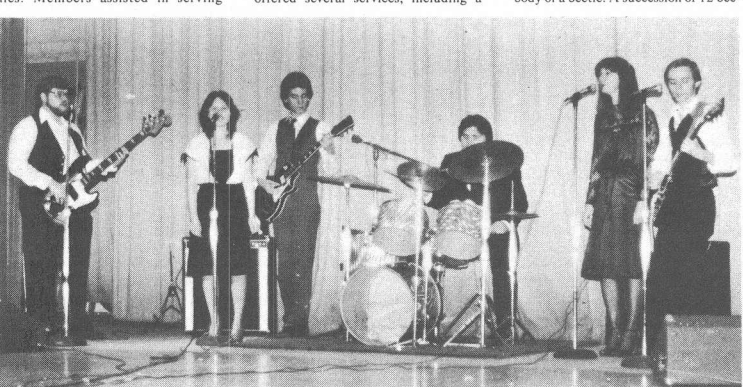
TALENT SHOW — Chicago, III., West musicians and singers perform at the church's talent show Feb. 13. (See "Church Activities," this page.)

30. The YOU members served a variety of dishes. Lowetta S. Jones. The MONTVALE, N.J., church played host to the MERIDEN, Conn., church for a Sports Sunday Feb. 21. The day included basketball, volleyball and "cheering. The food committee sold hot dogs, juice, fruit and coffee. In addition to the sports activities, the church offered several services, including a