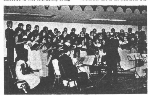
SPECIAL MUSIC — The Pasadena Church Choir and Chamber Ensemble perform at the Tijuana and Mexicali, Mexico, combined Sabbath services Aug. 21 in Tijuana. (See "Church Activities," page 7.)