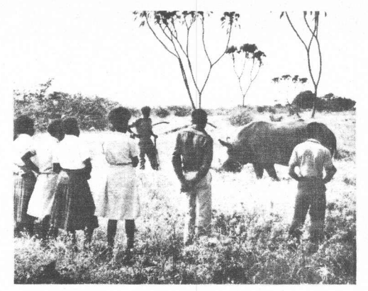
GAME VIEWING — Young people of the Kibirichia, Kenya, church observe a rhino during an outing to the Meru National Park Aug. 15 and 16. (See "Youth Activities." Dage 12.

The LETHBRIDGE, Alta., church conducted its first orienteering outing