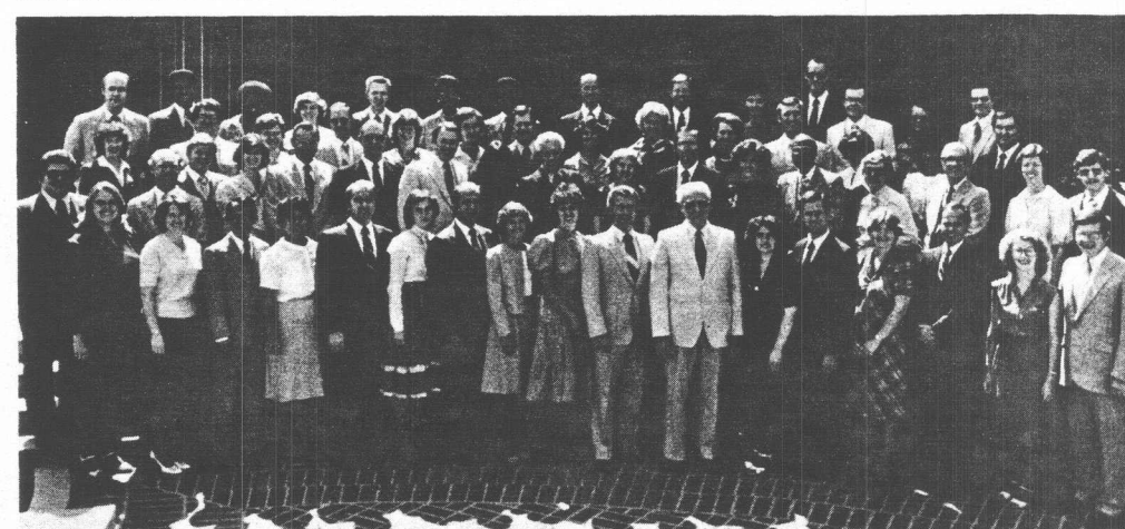
REFRESHING PROGRAM — Ministers and wives participating in the 10th session of the Ministerial Refreshing Program Aug. 30 to Sept., 9 gather for a photo at the Loma D. Armstrong Academic Center on the Pasadena Ambassador College campus Sept. 2. Ministers and wives attended from Northern Ireland, Australia, New Zealand, Canada, the Philippines, Trinidad, South Africa and the United States.