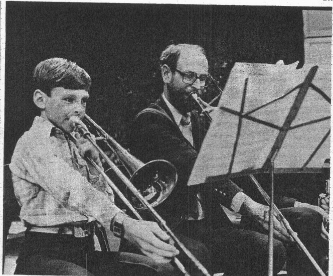
CAPE COD, MASS.