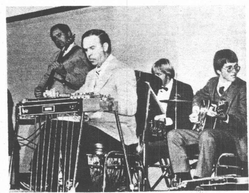
FEAST PICKIN' - Brethren try their hands at pickin' and playing during a social at the Festival in Spokane, Wash.

The deaf at Squaw Valley weren't (See 1982 FEAST, page 5)