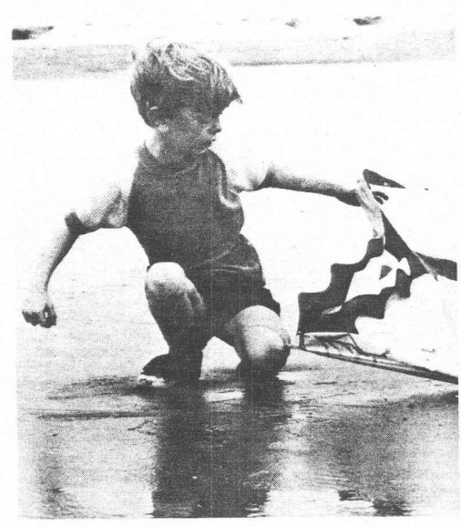
WIND, SURF AND SAND - A youthful Feastgoer prepares to launch his kite at Jekyll Island, Ga.