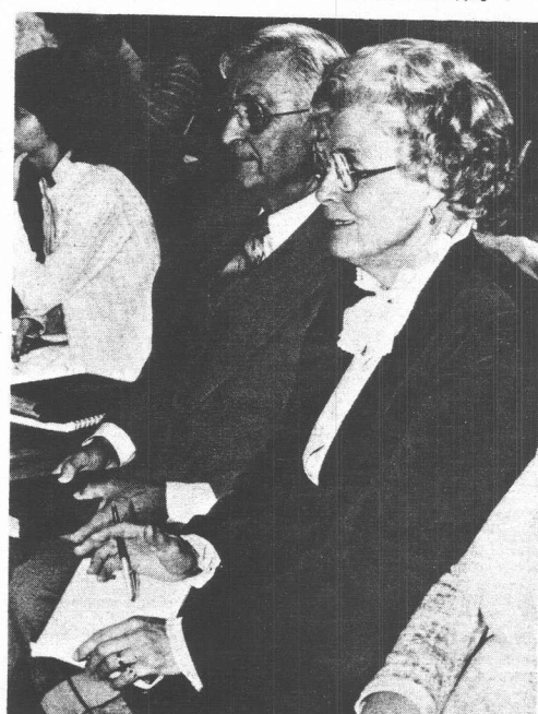
THOSE WHO HAVE EARS - Brethren listen during Feast of Tabernacles services in Mount Pocono, Pa.