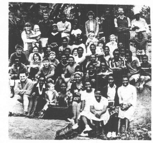
ZIMBABWEAN SEP — Youth Opportunities United (YOU) members and staff pose for a photograph Aug. 22 during the Summer Educational Camp at Lake Lesapi.