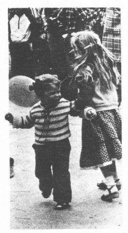
FAMILY DAY FUN — Arm in arm, two children enjoy family day Oct. 6 in Squaw Valley, Calif.