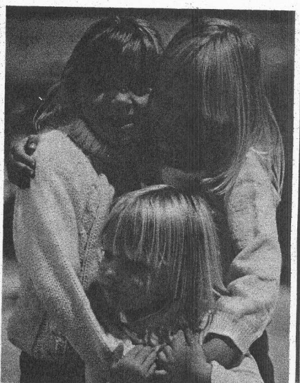
RAPID CITY, S.D.