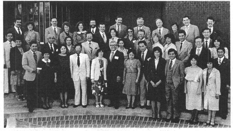
SPANISH-SPEAKING MINISTRY — The 13th session of the Ministerial Refreshing Program included the above ministers and wives from Mexico, Argentina, El Salvador, Puerto Rico, Chile, Colombia, Peru and the United States.

'When I was translating for the American Embassy, they asked me if I wanted to interpret," she recalled. "Well," she said, "I don't know if I can. So they opened a book written in Spanish and asked me to read it in English and vice versa. They thought I did it well, so they