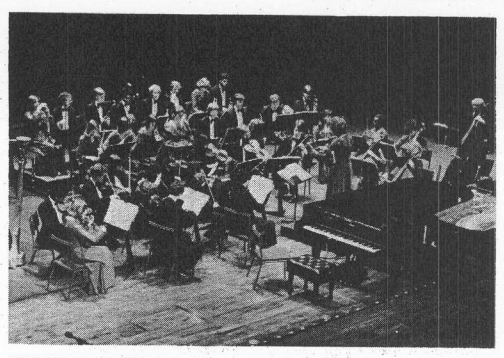
ENSEMBLE ASSEMBLY — The New England Youth Ensemble performs for the Pasadena Ambassador College student body during assembly in the Ambassador Auditorium Jan. 13. The ensemble has performed for the President of the United States and in the Soviet Union

The program, which begins in June, stems from the Ambassador College Educational Project in Thailand (ACEPT), which ended in December. In that program Ambas-