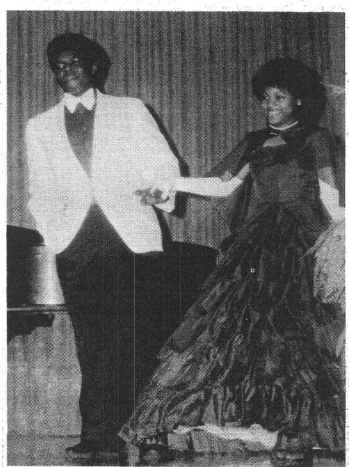
FORMAL FASHIONS — YOU members model formal wear in a fashion show at the Los Angeles, Calif., church's family fun night Dec. 19. (See "Church Activities," this page.)