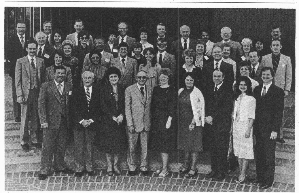
REFRESHING COURSE — Ministers and wives participating in the Jan. 10 to 20 Ministerial Refreshing Program pause on the steps of the Loma D. Armstrong Academic Center in Pasadena Jan. 13. This session, the 13th, included ministers and wives from God's Work in Spanish-speaking areas. They are pictured on page 4. The above ministers are from Canada, Fiji and the United States.