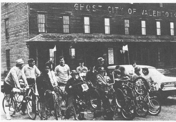
BIKE HIKE — Members and youths of the Rochester, N.Y., church, prepare for a 20-mile bicycle ride from the historic ghost town of Valentown, N.Y., May 30.

BRICKET WOOD, England — The final ladies' night of the A and B