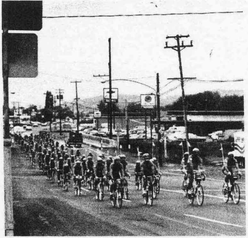
CYCLISTS - The Ambassador-sponsored cyclists roll down a Tillamook, Ore., street under police escort on their 4,300-mile trek across the nation. They are now more than halfway through their bicentennialinspired excursion.