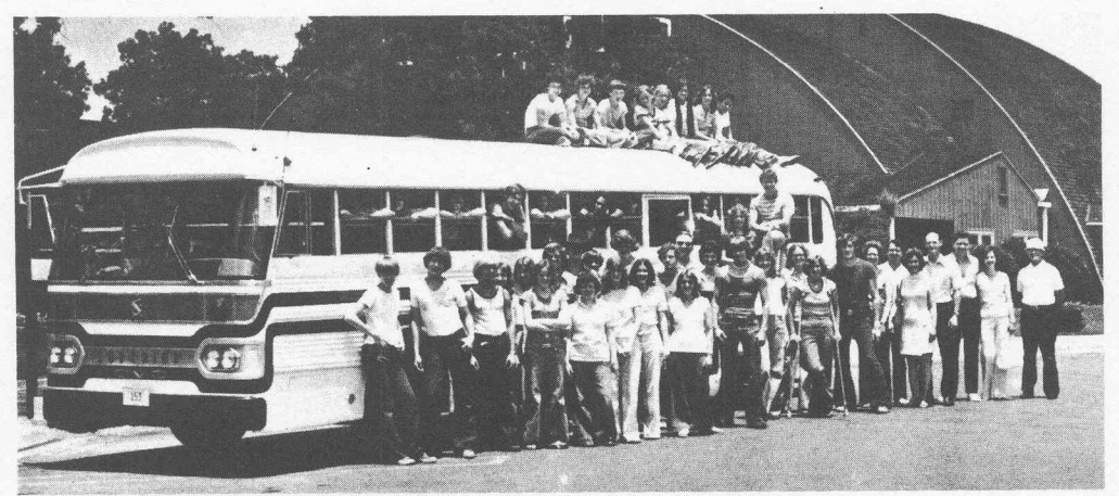
BIG SANDY OR BUS(T) — Thirty-seven YOUers and their advisers pose with the school bus the group bought.