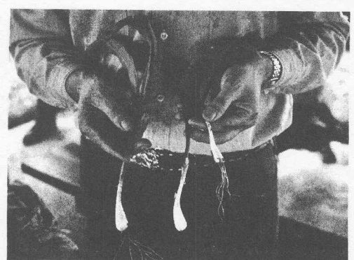
KING OF THE WILD FOODS - The ramp, a member of the onion family with a mild garlic flavor, is the basic trimming for any wild feast, ramp connoisseurs say.

able at most national and state parks through outdoor-interpretation programs. Often state universities and their botanical gardens offer short courses through extension programs. The Audubon Society also has programs.