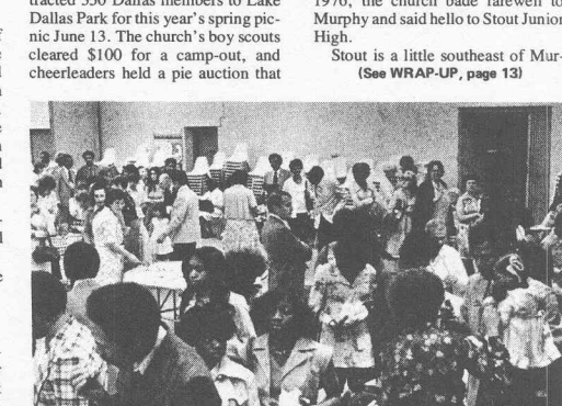
FAREWELL TO MURPHY — Members of the Detroit West church celebrate moving to a new hall with a social May 29. (See "West-Church Story," this page.)

So, on the Sabbath of June 5, 1976, the church bade farewell to Murphy and said hello to Stout Junior