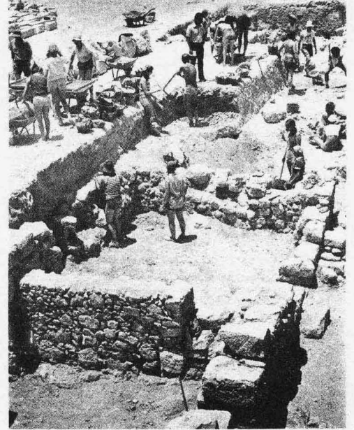
JERUSALEM DIG — Ambassador students work at the excavations near the Temple Mount. (See article below.)