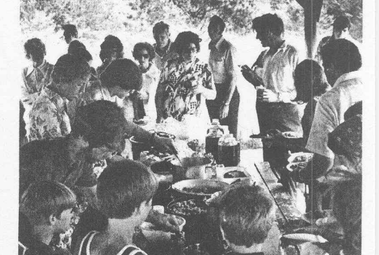
THE FEAST BEGINS — Members of the Lenoir, N.C., Greenville, S.C. and Asheville, N.C., churches gather for a feast of wild dishes. Nearly all the food for the dinner was found growing nearby.

This insures positive identification of everything collected, since a wrong identification could possibly mean poisoning.