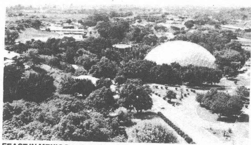
FEAST IN MEXICO — A geodesic dome, above, covers tropical gardens in Oaxtepec, site of the 1978 Feast in Mexico. Right: Two Feastgoers in 1977 enjoy the relaxing atmosphere in Oaxtepec. Below: The Pyramid of the Sun is not far from the site.

their Egyptian counterparts. The proximity of sophisticated Mexico City, the largest city in the western hemisphere, makes available museums, amusement parks, nightshitte the nightclubs, theaters, world-famous restaurants and a multitude of other attractions to the Feastgoer.