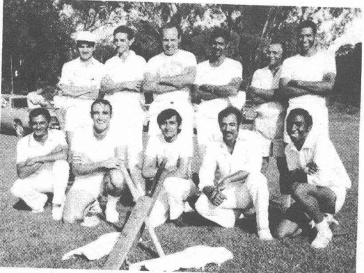
CRICKET FIRST — The Johannesburg cricket team, left, and its Cape Town counterpart, right, meet March 26 for the first match between Johannesburg and an outlying church's team.