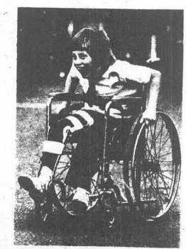
SPECIAL OLYMPICS - A handicapped youngster competes in a race in the Special Olympic