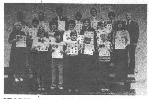
RIFLE CLUB — Members of the Buffalo, N.Y., church's Rifle Club display the awards they received during the 1978-79 season. (See "Sports," page 7.)

Each month the ladies of the (See CHURCH NEWS, page 7)