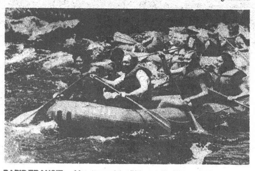
RAPID TRANSIT — Members of the Philadelphia, Pa., and Hammonton and Trenton; N.I., churches challenge the white water on the Lehigh River in the Pocono Mountains May 28. (See "Church Activities," this page.)