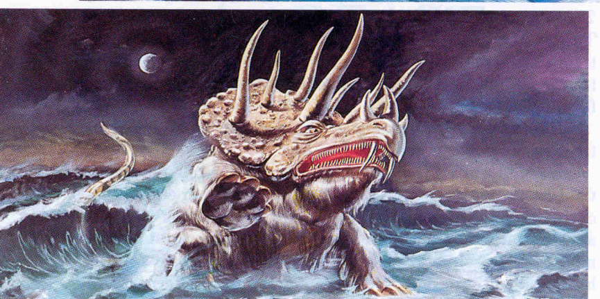
THE THIRD BEAST in Daniel's dream was followed by a fourth that was "dreadful and terrible" (Dan. 7).

civil government martyred millions who were declared "anathema from Christ" or "heretics."