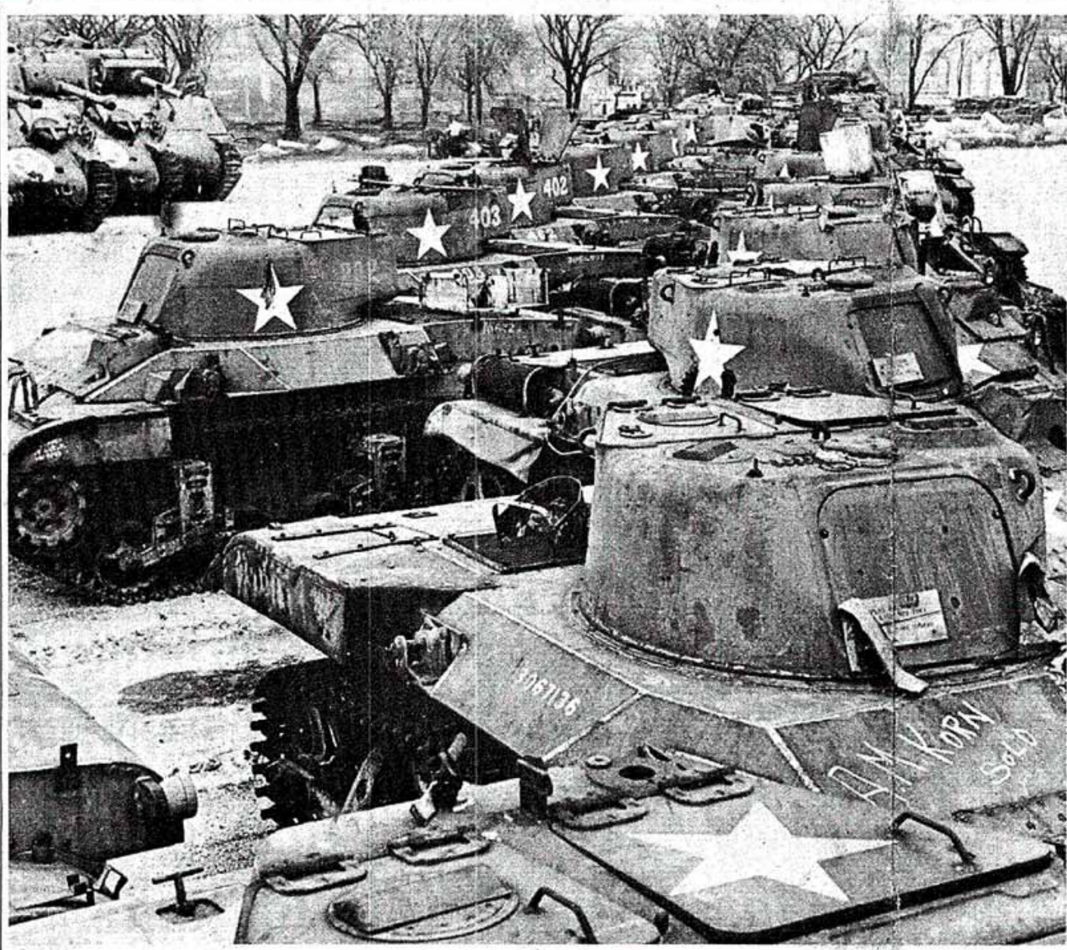
The "swords into plowshares" principle swings into its final stage as these iron monsters of destruction are converted to stump-pulling, log-dragging, land-plowing tools of peace.

It's heartening to see such a change in this wicked nation.