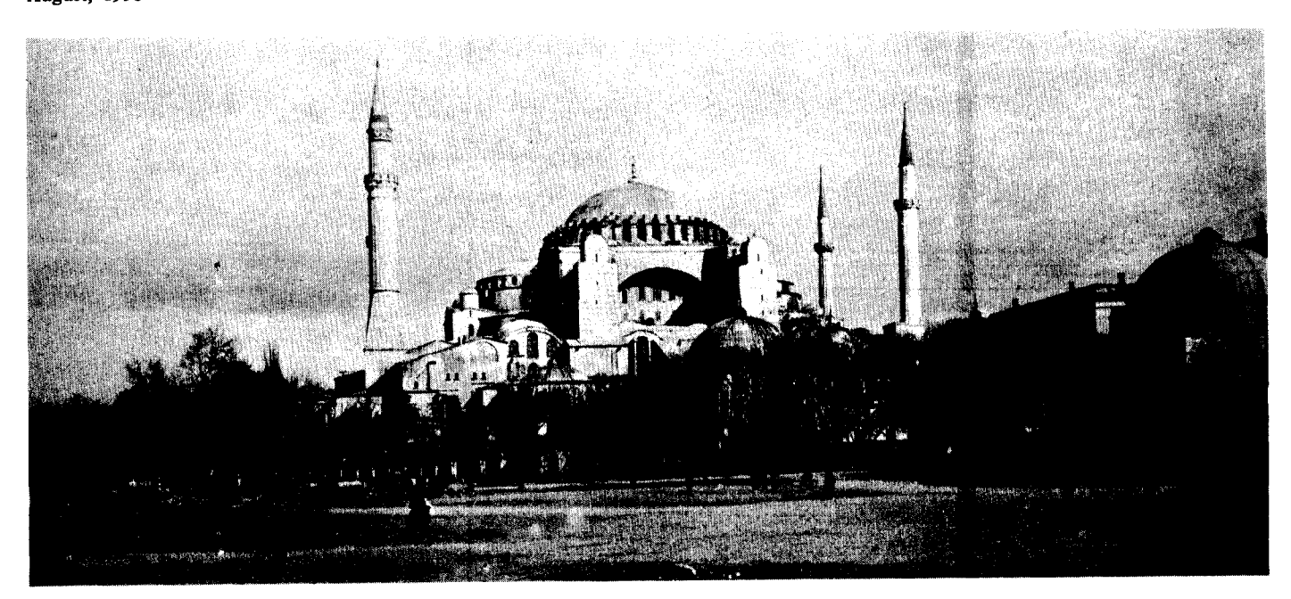
The world-famous church of St. Sophia in Istanbul, Turkey. On this very site in 325, Constantine the Great built a Catholic basilica. After it was destroyed by fire and riots, Emperor Justinian dedicated a fabulous new church on the same site in 527. The Turks transformed it into a mosque in 1453. This city was anciently made the chief capital of the Roman Empire by Emperor Constantine—who named the city Constantinople, after himself. By moving the chief capital here, the Emperor left the Bishop of Rome free to develop absolute control over religion in Western Europe.

out this entire period weakened the papal influence, and began to prepare men's minds for the later attempts at reformation (Mosheim, p. 490).